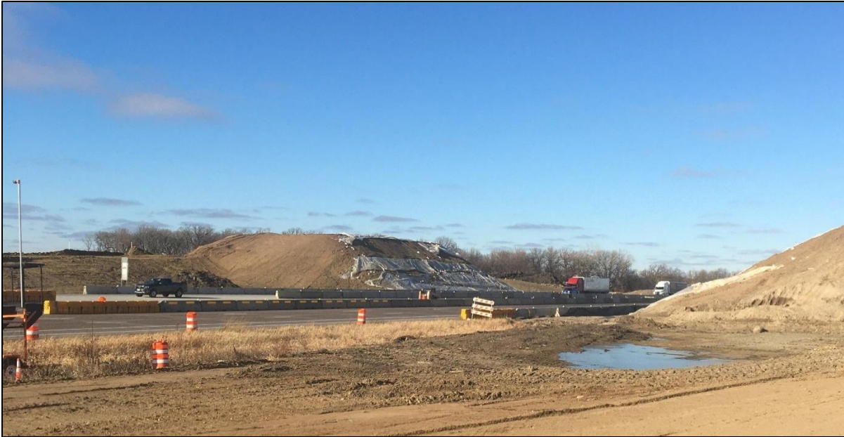
A view of the future Dayton Parkway bridge embankments on either side of I-94