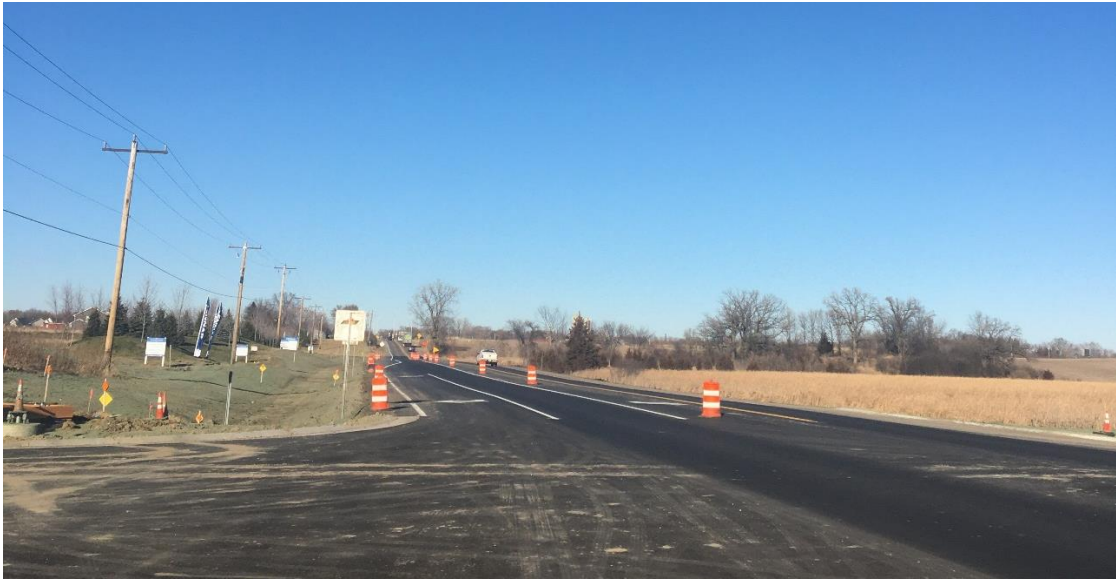
The completed widening of Brockton Lane looking North. The improvements include right and left turn lanes at the intersection of the new Dayton Parkway.