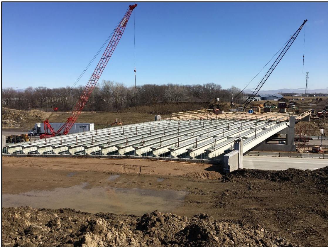
A view of the Dayton Parkway bridge beams over I-94 from the west abutment looking to the east.