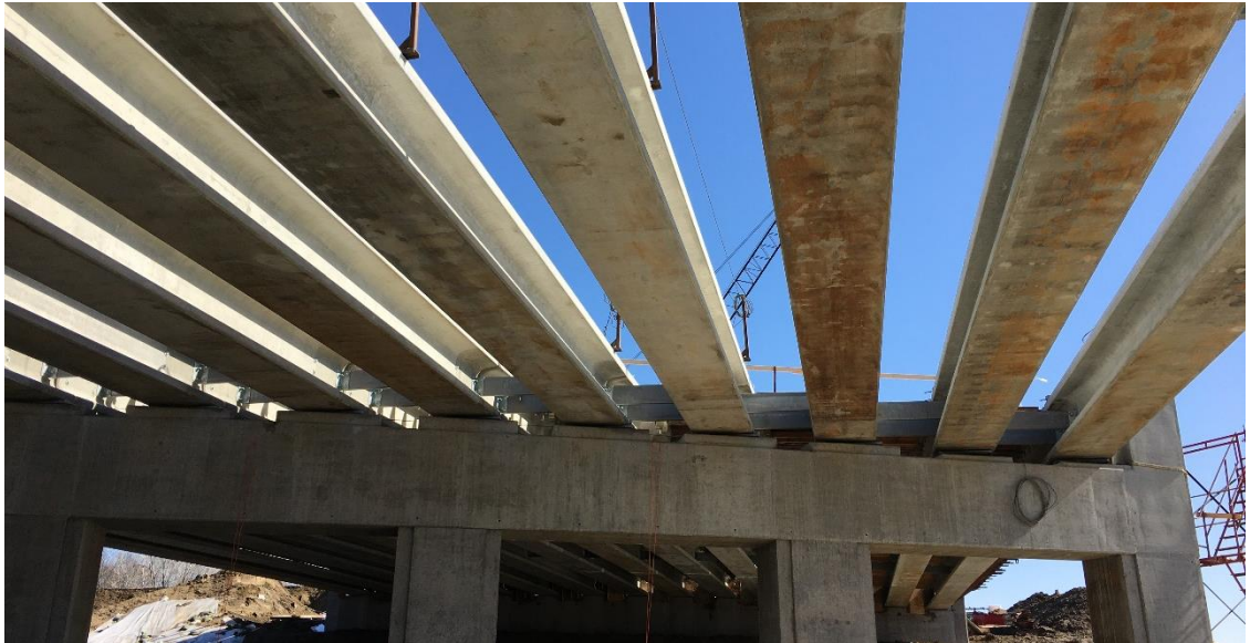
A view from I-94 below the newly erected Dayton Parkway bridge beams.