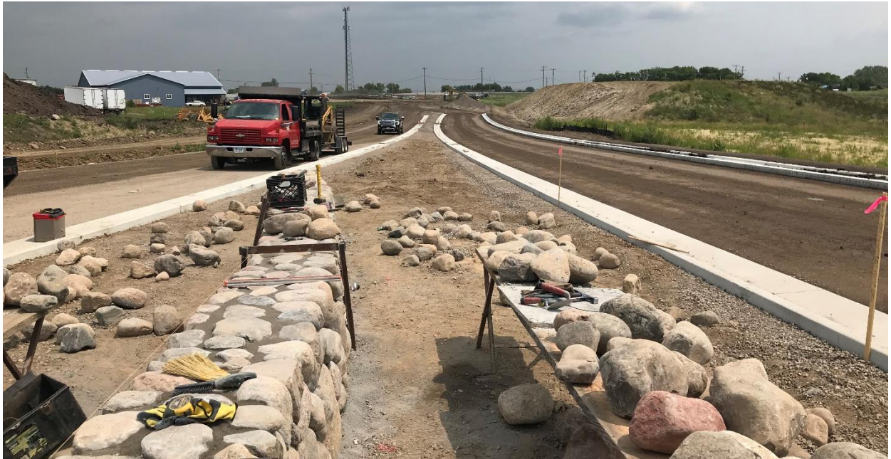
A view of the new Dayton Parkway looking east towards CR 81 as construction of the parkway progresses.