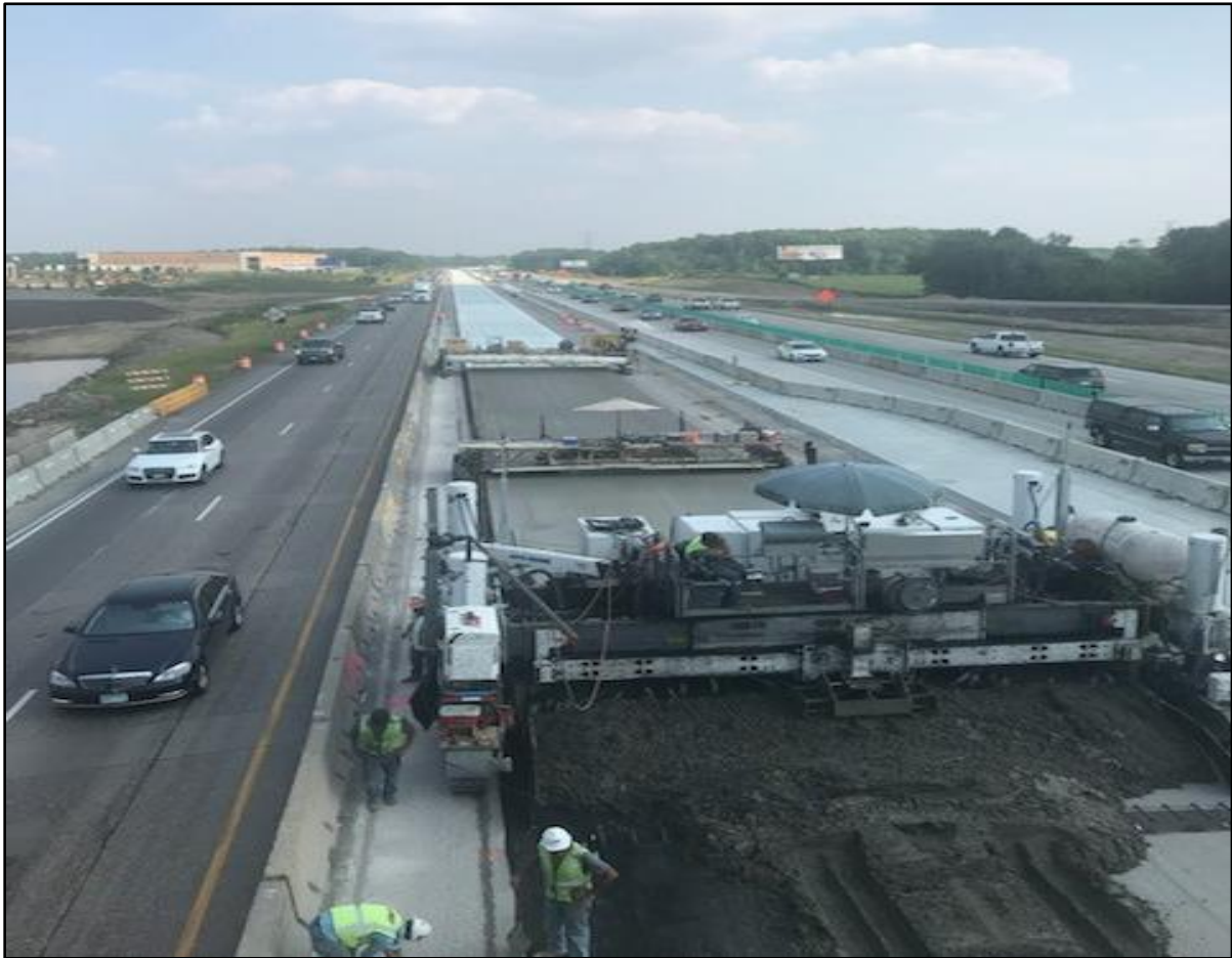
A view from the new Dayton Parkway bridge looking down onto the I-94 design-build project below.