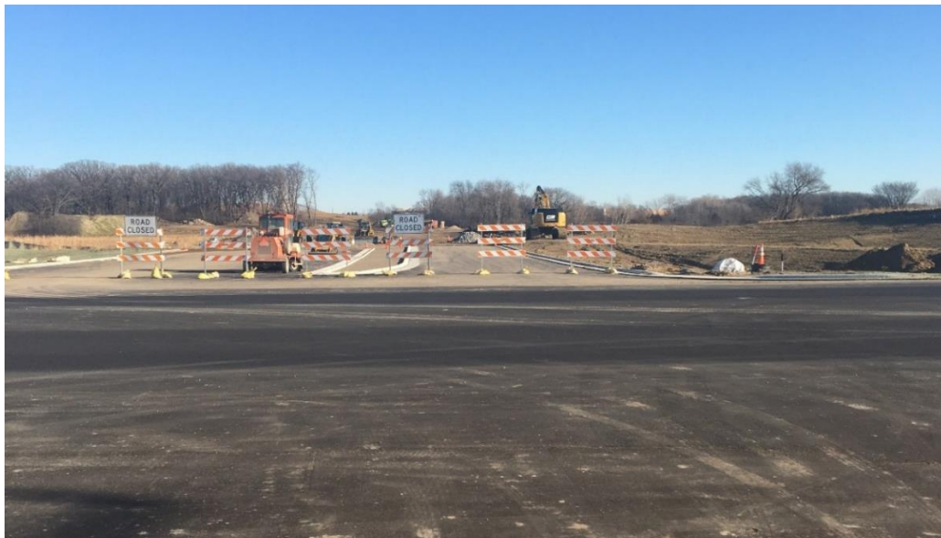
A view looking down the future Dayton Parkway from the Brockton Lane intersection.